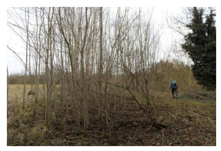
Clearing Ash Saplings

At the end of March we finished off some work we have been slowly nibbling at over the last year or two. That was the removal of ash saplings in the mainly open area above the Bridge car park on Daisybank Road (what we call Area 16) and stacking up the cuttings. There are a lot of Ash trees on the Hill and Ash trees are well