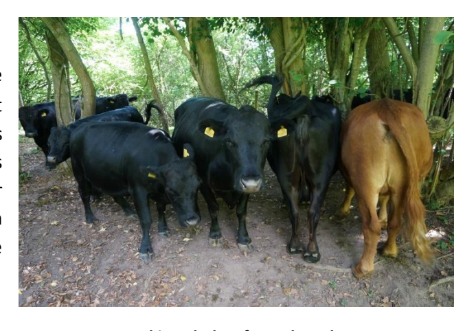
Taking Shelter from the July sun

harvested using a machine that recovers wildflower seeds. resulting hay-like material will be stored under cover to dry. For a week the hay will have to be turned three times a day to ensure it dries out. Volunteers to help with the work will be appreciated. September seed will be spread on Area 16, just uphill from the Daisybank carpark. This will be the first time that the Magnificent Meadows project have tried this experiment in reseeding areas that used to have grassland wildflowers. Seed will be made available to other