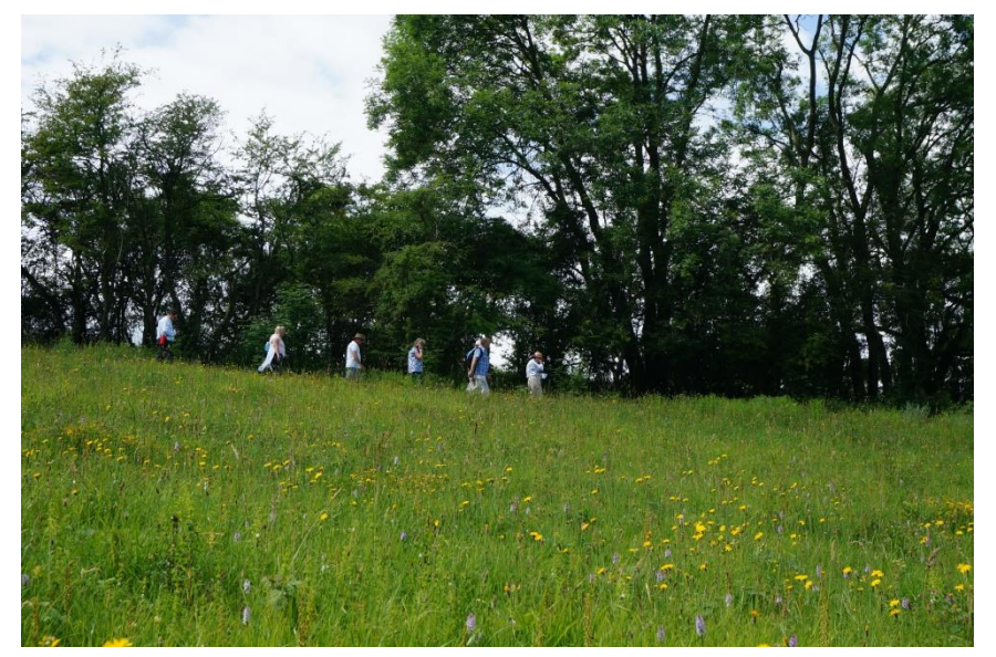
Walking the Cotswold Way through Cowslip Meadow

As part of local involvement in the Magnificent Meadows project, soil at various places on the site has been tested to check if the Hill is suitable for spreading wildflower seeds. In July a third of Cowslip meadow will be