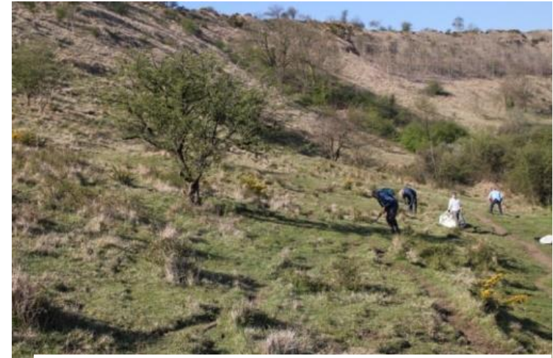
Keeping the Gorse at bay

So, that's what we have been doing recently. What are we planning to do next?