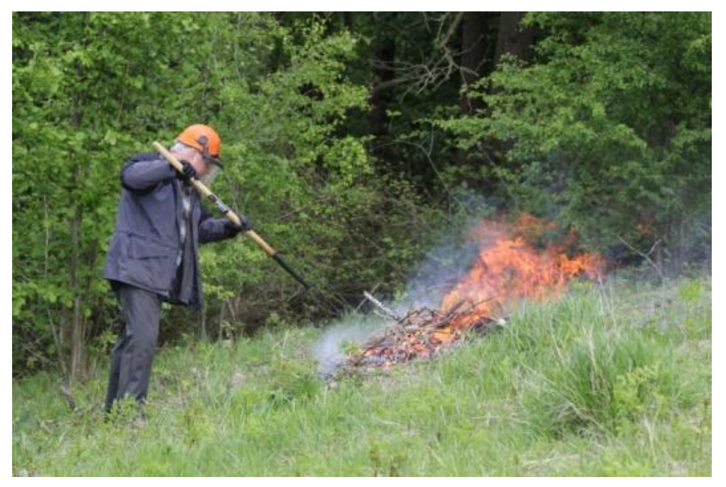
Finishing the job with a bonfire

As always you are welcome to join us on one of our work parties. We are a friendly mixed group male and female members. You can work at your own pace and take a break as and when you wish. We meet at 9.30am at Tramway Cottage Car Park, Daisybank Road, and are on the hill for approximately 3 hours. Tools are provided by FOLK. For your own safety we ask you to bring and wear stout footwear and tough gardening gloves.