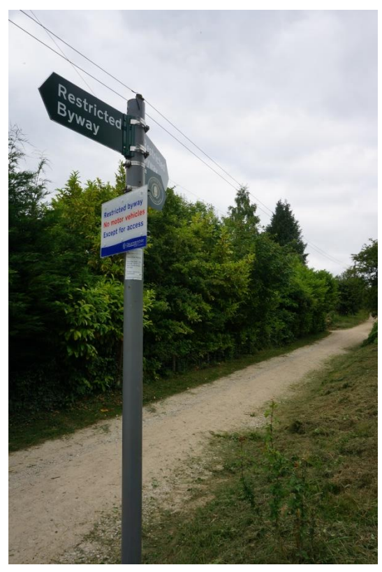
New Byway sign Daisybank Road

In order to help solve a problem of overflowing bins in the carparks around the Hill, it is proposed to install some new bins . These would be similar to ones used elsewhere in the town. Comments on the new design would be welcome. Examples can be seen via this link: <a href="http://wybone.co.uk/product/wts8d-double-iroko-hardwood-bin/">http://wybone.co.uk/product/wts8d-double-iroko-hardwood-bin/</a>