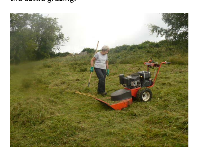
Getting to grips with the scrub

The priorities for managing a SSSI are rather different from the objectives for managing the Council's other agricultural holdings and FOLK is determined that this difference is recognised. There are a number of issues associated with mixed grazing and FOLK is working with the cattle grazier and CBC to ensure these issues are properly addressed and don't adversely affect the cattle grazing.