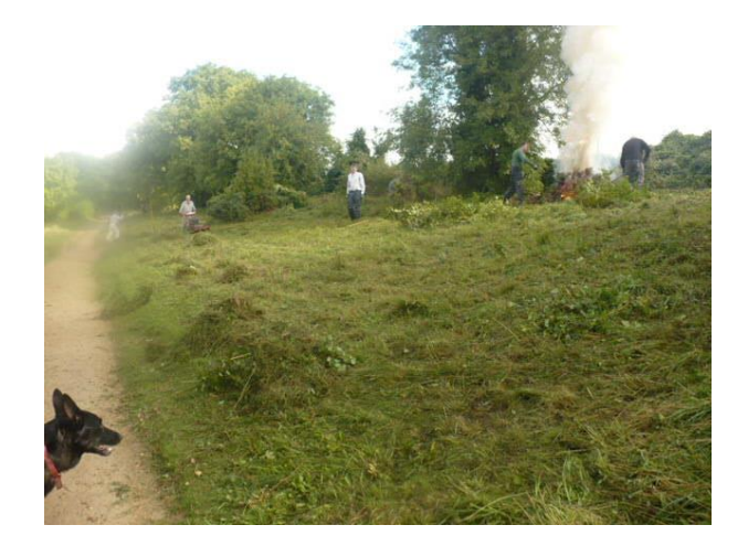
Work party and dog enjoy the fresh air

A site survey has been completed to put together the Work Party Programme for the winter months 2013/14. Included in the works are more clearance of the grassland and scrub in the glades above Bridge car park off Daisy Bank Road, which if cared for produces wonderful wild flower coverage in the summer and this area is much used by the public.