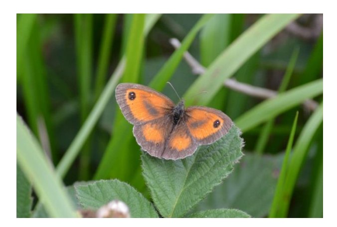
Gatekeeper

increased experience. Anecdotal evidence suggests this was a bumper year for butterflies. Time and future surveys will give a clearer picture.