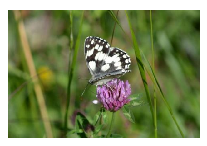
Marbled White.....©Russell Smith

On the downside, Chalkhill Blues were only seen on LH in areas at the Salterley Quarry end, and not on the old CKCw site close to the pond near Daisybank Road. The colony may have gone from this area, but hopefully as the larval food plant Horseshoe Vetch is present the butterfly may find its way back. Duke of Burgundy was again seen on CKCe, but in a different location at the top of the slope close to the wall, but as this area has the larval food plant (cowslips) as well as shelter and shade from scrub, there is no reason why a colony should not establish itself here. Usually it is seen in the area above the Golf Course and casual reports from other observers have been received for this area again this year.