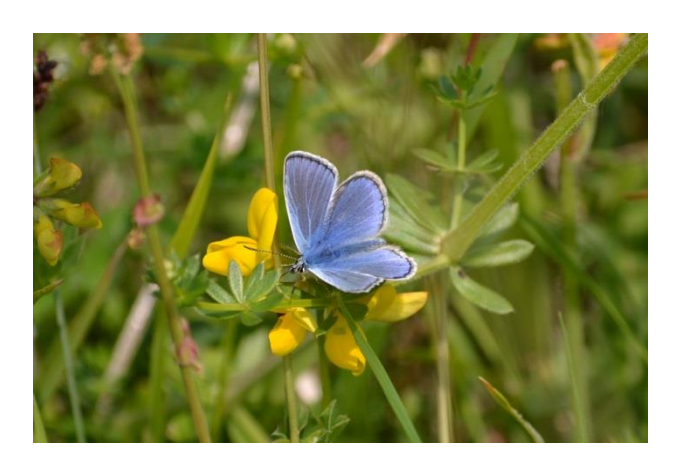
Common Blue.....

divided into survey areas – (1) Leckhampton Hill + Brownstone Quarry[LH], (2) Charlton Kings Common west of the Windass Hill track[CKCw], and (3) Charlton Kings Common east of the Windass Hill track + the Cowslip field[CKCe]. Within each area, numbered sections were identified, representing variations in habitat type. A fixed route was agreed during an initial "walk around" with the volunteer(s). A total of 30 sections were surveyed. Species seen in each section would be noted. A rough count would be made, for some species; recording 1, some (2-5) individuals), more than 5. This was to ensure that in future years records can be compared like for like. Then it was all systems go ..... except the seasonably cold spring meant no butterflies.