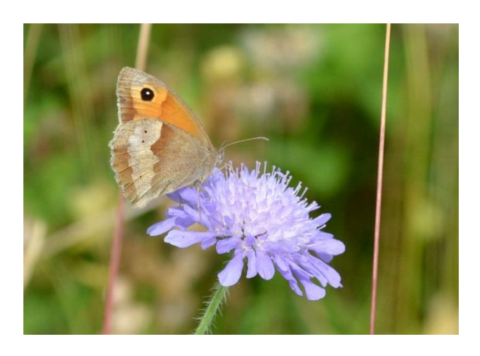
Field Scabious, with Meadow Brown

As the beneficial effects of grazing and the FOLK work parties are seen in the conditions of the habitats on the Hill and Common, we are continuing to monitor the wild flowers at a number of places.