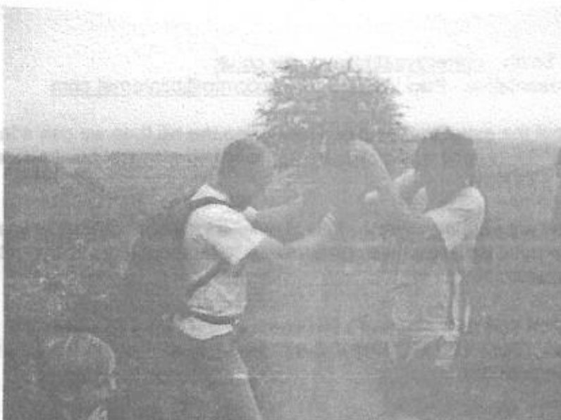
Mountain Bikers help with cattle fencing