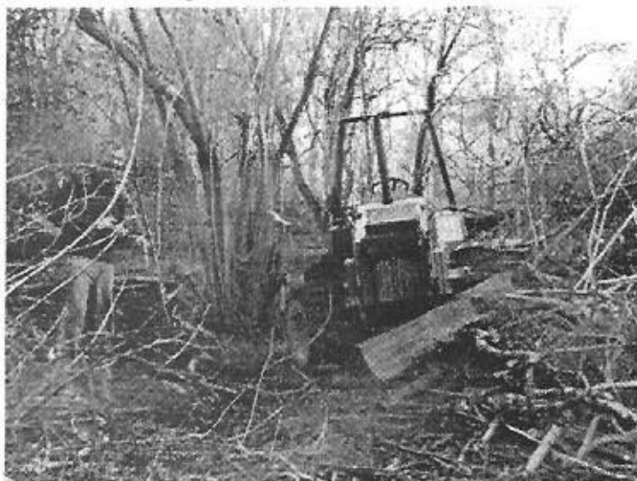
Work on the pipeline along the Gallops (east end of the common)

The installation of mains water supply and cattle troughs, which was front-page news on our last newsletter, is proceeding slowly due to problems with the trenching for the pipeline. This trenching has left parts of the track leading around the hill to Daisybank Road in a very poor condition. We apologise to hill users for this but hope to see improvements in the near future.